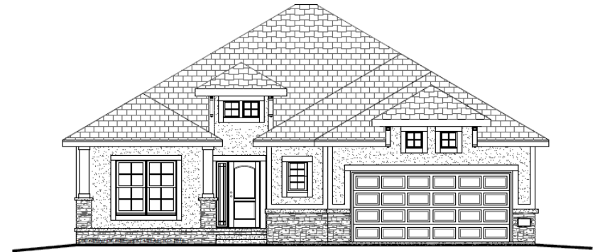
A – MEDITERRANIAN