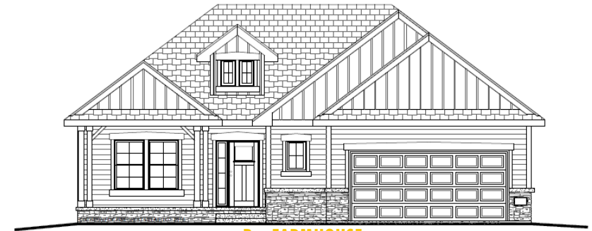
B – FARMHOUSE